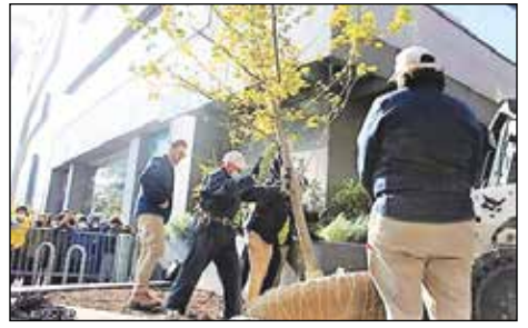
Students from Battery Park City School watch as the silver maple is planted in Battery Park outside the Museum of Jewish Heritage.

be cared for by children — in this case, students at PS/IS 276: The Battery Park City School, a public elementary and middle school located just across the street from the museum. In collaboration with the museum, the school will make the tree part of an ongoing curriculum in Holocaust education.