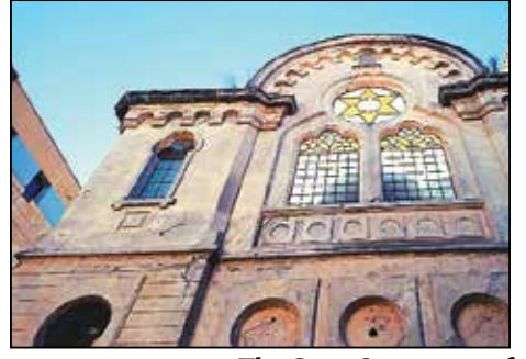
The Great Synagogue of Constana in Romania.

The law would ensure that "the history and identity of Romanian Jews