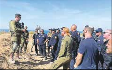
A delegation of US rescue workers visits Israel following joint work with IDF Home Front Command soldier on the Surfside condo collapse,

For the IDF team, the orderly fashion in which the Americans operate, their logistical capabilities and their comprehensive written doctrine were