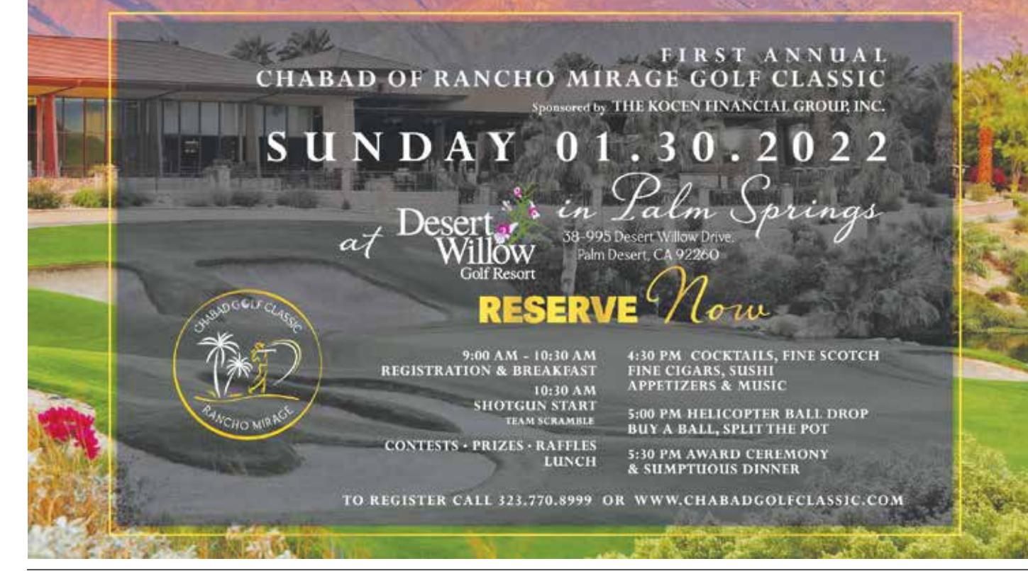
UPCOMING IMPORTANT COMMUNITY DATES

The Romanian Parliament has recently passed several bills expanding financial support for Holocaust survivors in the country and promotes the opening of the National Museum of Jewish History and the Holocaust in Romania, which will reportedly take a "few years" to establish. Another recent law considers all antisemitic incidents to be criminal offenses, punishable with prison sentences ranging from three months to 10 years.