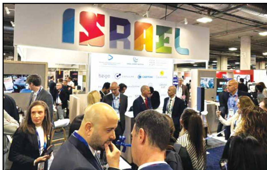
The Israel Pavilion at CES 2025 featured 14 startups.

pinpoints the location of the bugs, even in total darkness.