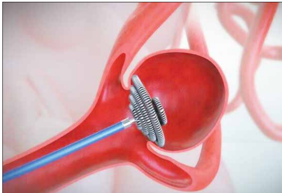
Endostream medical device for treating brain aneurysms

The device, which the startup says has been successfully implanted in hundreds of patients around the world, received regulatory approval in Europe in November 2024. Regulatory approval and launch in the US are expected in the