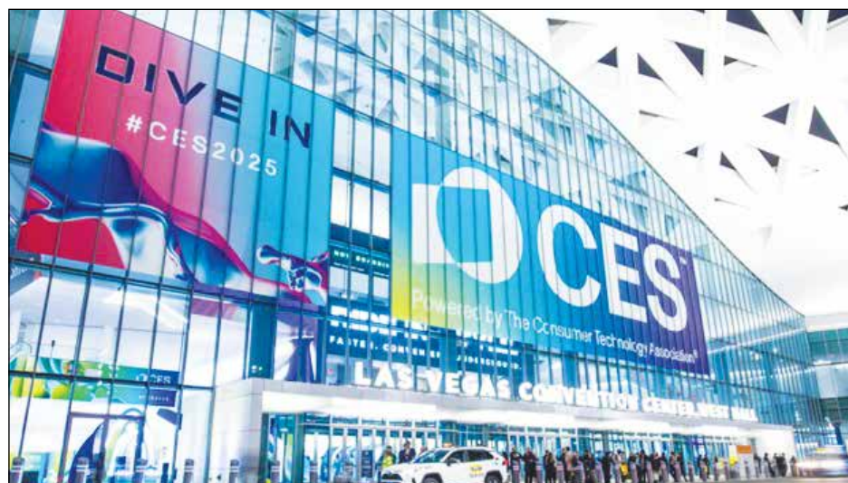
CES, the largest annual consumer electronics trade show in the world, was held on January 1-7, 2025, in Las Vegas.

Bzigo, which makes an AI-powered indoor mosquito detection device that