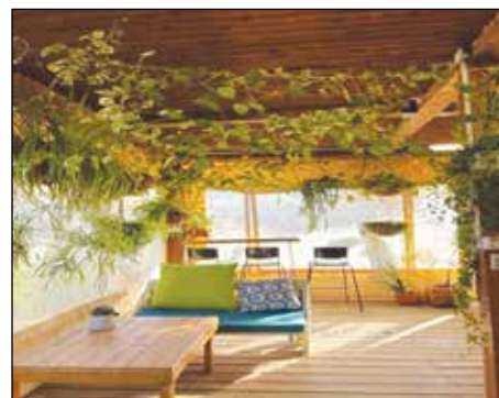
Wood Structure Built by High School Students in Ramat HaNegev