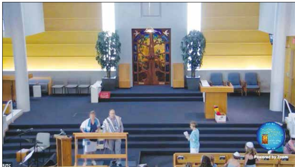
Pasadena Temple services in 2023