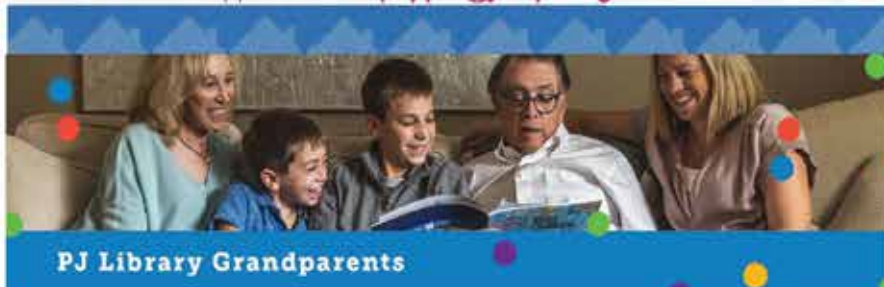
PJ Library Grandparents

The PJ Library program offers the gift of free high-quality Jewish books and music each month to children ages 6 months through 8 years. PJ Library books celebrate important aspects of Jewish culture, values and tradition, and become cherished bedtime stories. Sign up online at www.pjlibrary.org today. For more information about PJ Library programs in our community contact Leslie Pepper at leslie.pepper@jfedps.org or call 760-324-4737.