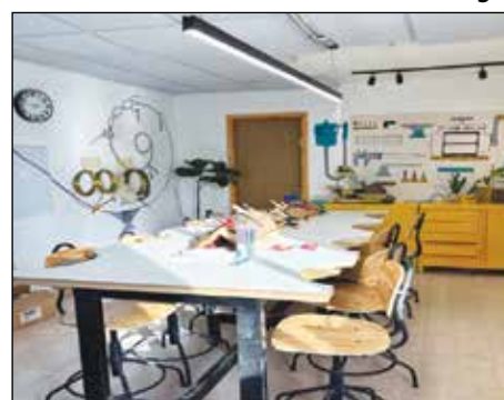
Metal working Workshop