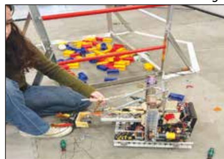
Robotics Program in high school at Ramat HaNegev