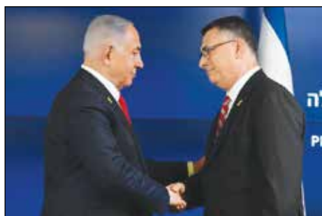
Prime Minister Benjamin Netanyahu and Israel's Foreign Minister (New Hope Party leader) Gideon Sa'ar

"A broad national plan is required that will also include optimal absorption of