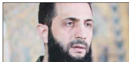
Hayat Tahrir al-Sham, leader of the Syrian rebel group

origins of life have been entirely removed from the curriculum, CNN reported.