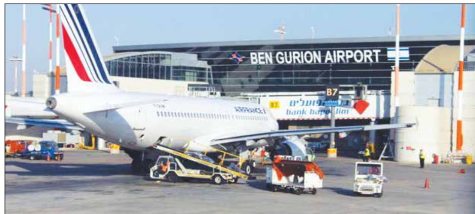
Tech Air at Ben Gurion Airport

According to CTECH, TechAir's flights will depart Tel Aviv's Ben Gurion Airport at midnight and land at New York's JFK Airport early the next morning. However, in order for the service to stay operational past March, it needs to sustain at least 35% seat occupancy.