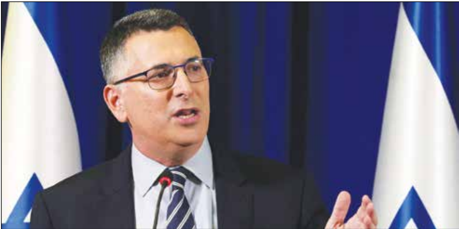
Israel's Foreign Minister Gideon Sa'ar

The news comes as public opinion about Israel in the United States and elsewhere around the world has been intensely battered as a result of a war that has left the neighboring Gaza Strip in ruins with much