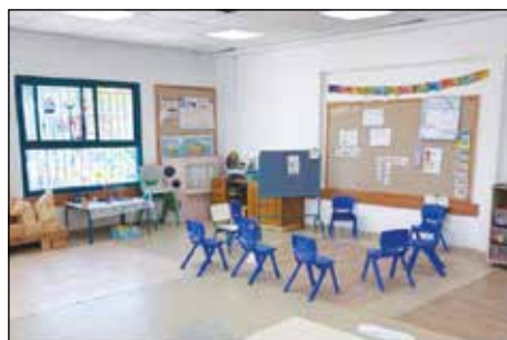
Special needs Kindergarten in Tlalim