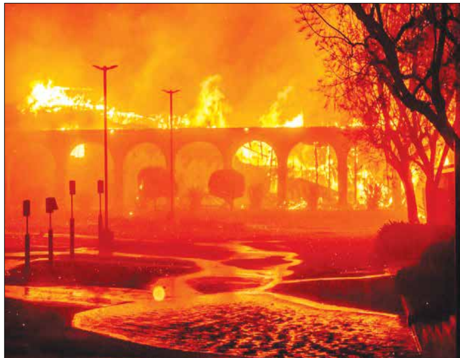
The Pasadena Jewish Temple and Center destroyed in the wildfire on January 7