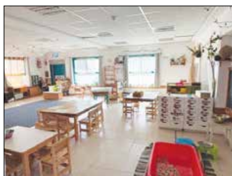
Classroom in Kadesh Barnea